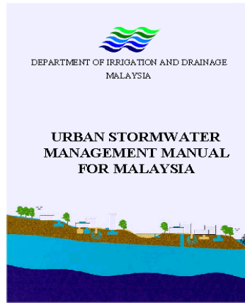
Fig. 1: MSMA Manual

Implementation of the Urban Stormwater management Manual (MSMA), DID 2000 – Erosion and Sediment Control (ESC) Programs in Malaysia (contributed by Urban Drainage Division, Department of Irrigation and Drainage, Malaysia).