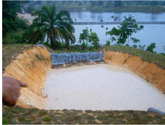
Fig. 2: Sediment Trap BMPs

Enforcement Activities. Collective approaches by various Government Agencies have been initiated to combine various expertise in this field. Current legislation like Street, Drainage and Building Act (SDBA) has been used widely emphasizing the polluter pays policy. Hefty penalties have been imposed, with the maximum fine up to 0.5 million Malaysian Ringgit (MYR) per conviction. To ease the prosecution process, the Government has embarked on compound mechanism without bringing the case to the court of law through direct payment to Local Authorities at a total value set at 0.25 million MYR maximum.